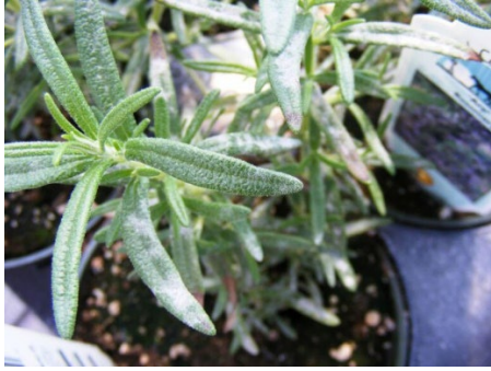
Powdery mildew in rosemary