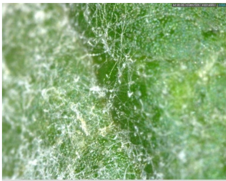
Cannabis powdery mildew; later development