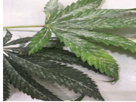
Cannabis powdery mildew