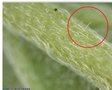
Powdery mildew single Conidia in cannabis

Understanding the preferred environmental conditions for the pathogen is the first step to control. Moderate temperatures and high humidity environments promote powdery mildew outbreaks. Unfortunately, beneficial environments for this pathogen overlap quite a bit with typical growth conditions for many crops. Spores germinate under high humidity conditions with dry leaf surfaces, while low humidity conditions promote the dispersal of spores.