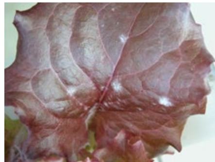
Powdery mildew in lettuce